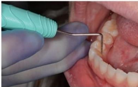
Figure 1. The use of big-handled instruments (pictured: PremierAir Probex Explorer [Premier Dental Products]) and proper finger rests can help reduce muscle workload and pinch force.