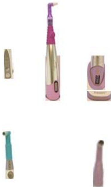
Figure 7. Several examples of cordless in their charging Cordless Prophylaxis and Pivot [Preventech], Prophylaxis 2pro Disposable Cordless Prophylaxis System [Dentsply Prophylaxis Angle [Premier Dental Products], Sirona]. right: NUPRO Freedom Cordless Prophylaxis System and NUPRO Freedom Slim.

on teeth with extrinsic stains. [25,26] An article by Pence et al [27] reported an insignificant loss of enamel during the coronal polishing procedure, while a recent report highlights the idea that improper coronal polishing can cause significant damage to gingival tissues, exposed dentin and cementum, enamel, and especially restorations. [28] Despite the theory of selective polishing, full-mouth polishing is routinely performed as a component of a dental prophylaxis. As a result of this reality, the term “selective polishing” has been updated to “essential selective polishing” to reinforce that if coronal polishing is to be routinely performed, then dental hygienists should select the most appropriate polishing or cleaning agents according to the patient’s individual needs. [29,3]