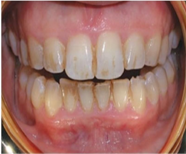
Figure 3. An otherwise healthy patient extrinsic stain, In this case, clinical appearance is much improved, either rubber cup polishing or air Note the absence of trauma to the polishing is appropriate,

by Johnson and Kanji, [21] the specific risk factors for dental hygienists were listed as repetitive movements, awkward and static postures, pinch-grasp, forceful exertions, vibration, poor ergonomics, and insufficient breaks.