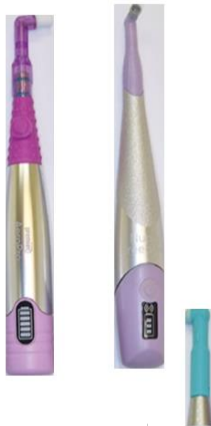
Figure 8. Several examples of cordless prophylaxis handpieces (left: Istar Cordless Prophylaxis Handpiece [DentalEZ], center: AeroPro Cordless Prophylaxis Handpiece System [Premier Dental center: AeroPro Cordless Products], right: NUPRO Freedom Handpiece System and Disposable Prophylaxis Angle [DentalEZ]).

So, why has coronal polishing become a seemingly routine part of the patient’s prophylaxis appointment? Explanations may range from patient expectations to the oral healthcare provider’s desires