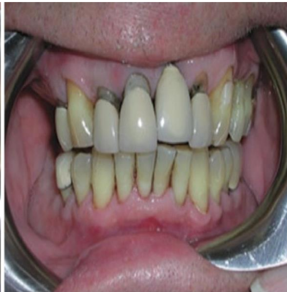
Figure 6. After the rubber cup polishing and complete stain removal,

The use of ultrasonic hygiene instruments has been reported as a means to decrease pinch force and reduce procedure time.