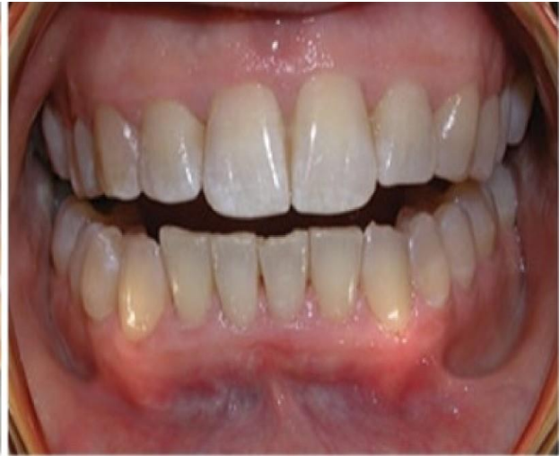
Figure 4. Following stain removal. the with a severe marginal gingiva,