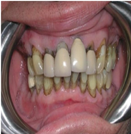
Figure 5. A patient with a severe stain who, because of restorations and an exposed root surface, is not appropriate for air polishing, Conventional rubber cup polishing is recommended,