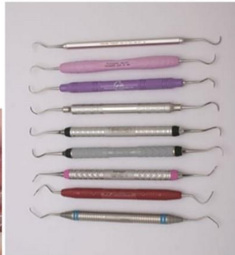
Figure 2. A variety of dental hygiene instruments demonstrates the trend away from small-diameter handles toward larger-diameter, textured handles. From top to bottom, the instruments are the Premier scaler H6/H7 (Premier Dental Products), PremierAir scaler H6/H7 (Premier Dental Products), American Eagle EagleLite Resin Scaler H5-33 (American Eagle Instruments), American Eagle EagleLite Stainless H6-7 (American Eagle Instruments), Hu-Friedy DE Scaler H6/H7 (Hu-Friedy), Hu-Friedy DE scaler ResinEight H6/H7 (Hu-Friedy), Hu-Friedy Nevi Posterior EverEdge (Hu-Friedy), PDT R144 Queen of Hearts (PDT), and Nordent DuraLite ColorRings CESC135 (Nordent Manufacturing).

An early study by the ADA found that 9.2% of dentists had been diagnosed with a repetitive motion disorder, causing 19% to require surgery and 40% to work reduced hours. [12] Another study found that 71% of dentists experienced CTS symptoms, although only 7% were diagnosed with CTS. [13] This finding was also reported by Hamann et al, [8] who found the symptoms of CTS were more prevalent among dentists than in the general population. The authors noted several strategies for reducing CTS symptoms: a night-time wrist splint, pacing of work activity (including breaks to prevent extended wrist flexion), larger-handled instruments, fitted gloves, and improved wrist posture to reduce stress on the median nerve. [8] Additional strategies noted by another author include using sharp hand instruments to decrease needed force, adequate finger rests, using textured grips to reduce pinch strength, reducing cord pullback or tubing torque, and frequent stretch breaks 10 (Figures 1 and 2).